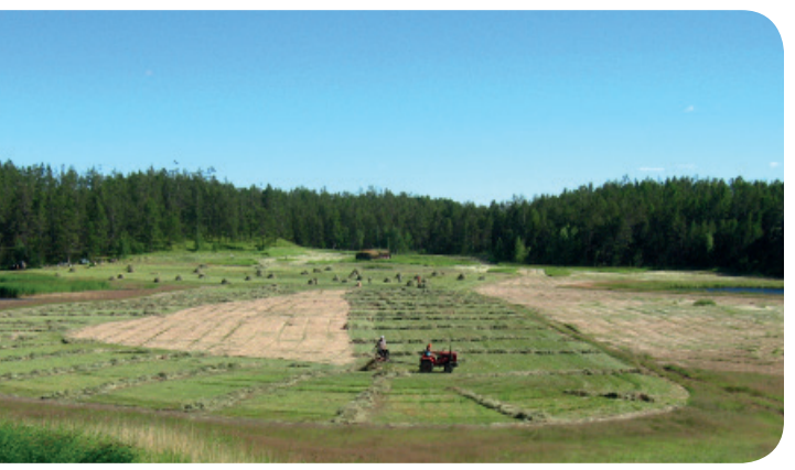
Large parts of the Central Yakutian lowlands are speckled with thermokarst basins, known as alas (alaas) and used by the local population for grazing cattle, making hay, and other forms of agriculture (Photo: M. Ullrich, July 2014).