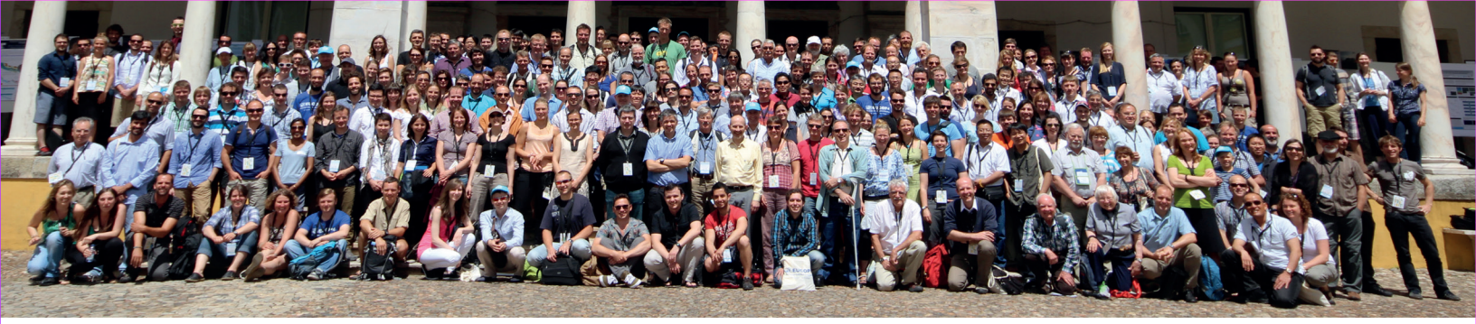
Group photo of EUCOP4 participants in Évora, Portugal. This figure is available in colour online at www.interscience.wiley.com/journal/ppp