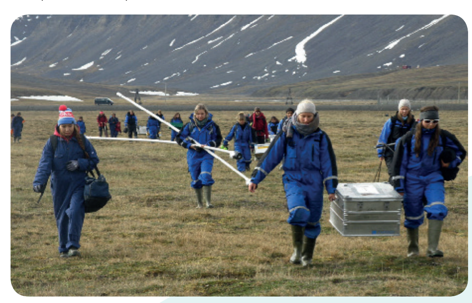
Students from the AG-218/219 International Bachelor Summer Fieldschool on their way to drill boreholes into permafrost in Adventdalen, Svalbard June 2014.