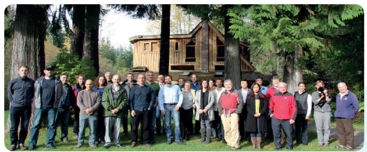
Participants of the 2014 workshop Impacts of permafrost thaw in mountainous areas of Canada and beyond:

t was recognized that an improved understanding of processes and phenomena is required, but also that many mountain regions in South America and in Asia have extensive permafrost areas of which we know little. Crucial knowledge gaps were identified relating to (a) how runoff and water quality are affected by changes in permafrost; (b) how ground thermal regime and ground ice contents vary spatially and in the future beneath mountain slopes; (c) how much carbon is incorporated into frozen deposits; (d) how vegetation and permafrost interact in mountains; and (e) how rock slopes and their stability respond to permafrost degradation.