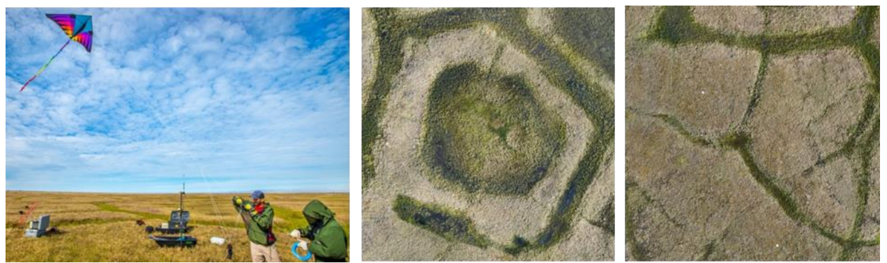
The picture on the left shows the co-acquisition of electrical resistivity tomography (ERT) along transects on the Barrow Environmental Observatory. Geophysical data acquired using the ERT arrays are collocated with point-scale measurements of various soil properties and landscape images using a kitebased platform equipped with a multi-spectral camera. Landscape images (such as the ones shown on the right) are involved in the reconstruction of geo-referenced mosaic and digital surface model, which are further used to investigate co-interactions between subsurface and surface properties.

electrical conductivity, and snow thickness. This research confirms the complementary nature of various ground- and aerial-based approaches and proxies to estimate soil properties within a framework that considers uncertainty, resolution, and spatial coverage. Among other results, a relatively strong relationship was observed between changes in soil electrical conductivity, water content, active layer thickness, and vegetation state. These associations reinforce the importance of