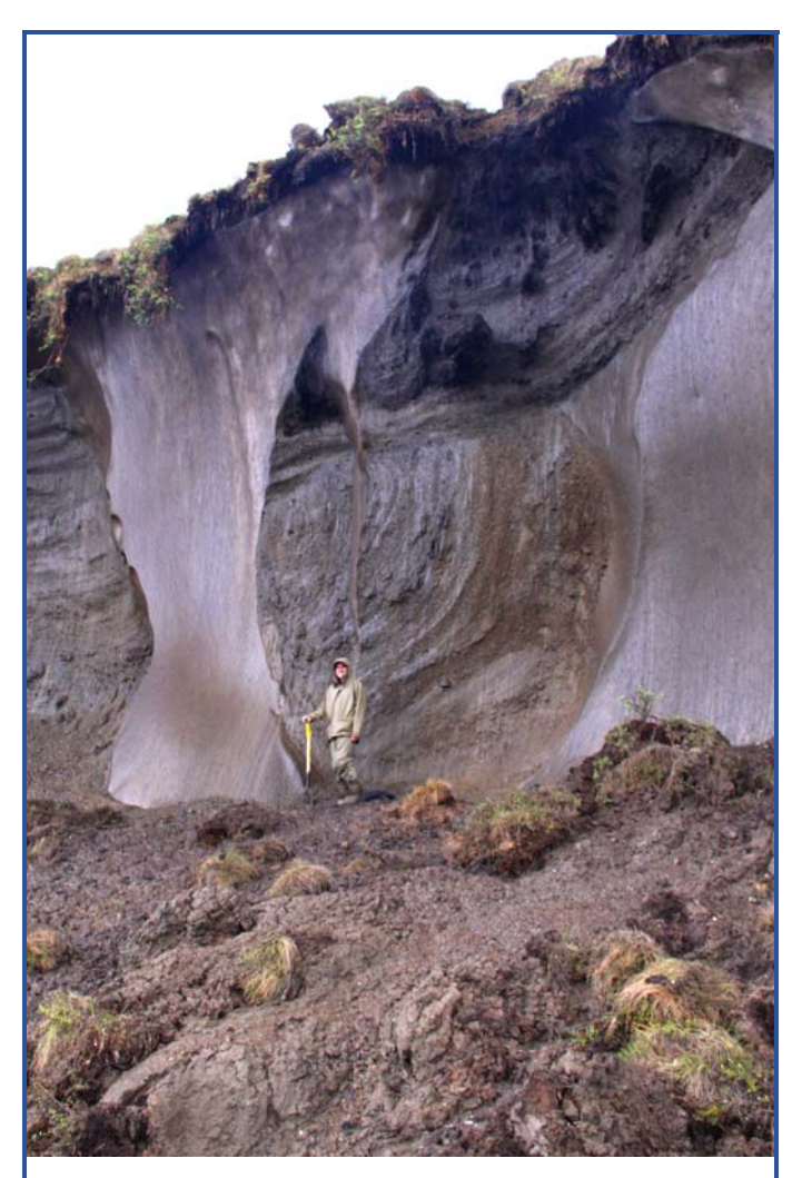
Ice wedges exposed along the Colville River on the North Slope, June 2009.

redistribution towards thermokarst depressions caused adjacent higher areas to become drier and resulted in increased moss mortality and shrub abundance.