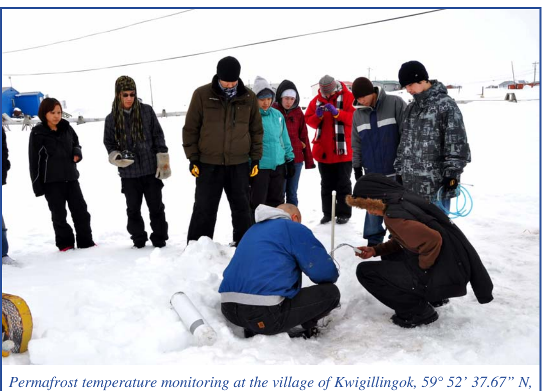
Permafrost temperature monitoring at the village of Kwigillingok, 59° 52' 37.67" 163° 9' 32.70" W.

in outreach education are developing a classroom lesson Permafrost/Active Layer in Alaska that will be included in a "Tunnel Man" movie series. Activities and teaching materials in the Permafrost Handbook encourage students to collaborate and communicate new ideas.