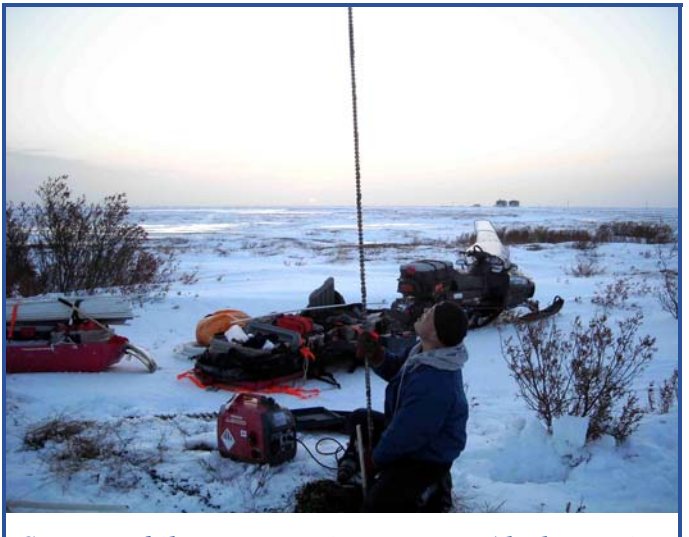
Snow mobile traverse in western Alaska spring 2009, drilling at Eek.

and AMSR-E) with an emphasis on water equivalent mass changes of Eurasian and North American watersheds as related to permafrost changes.